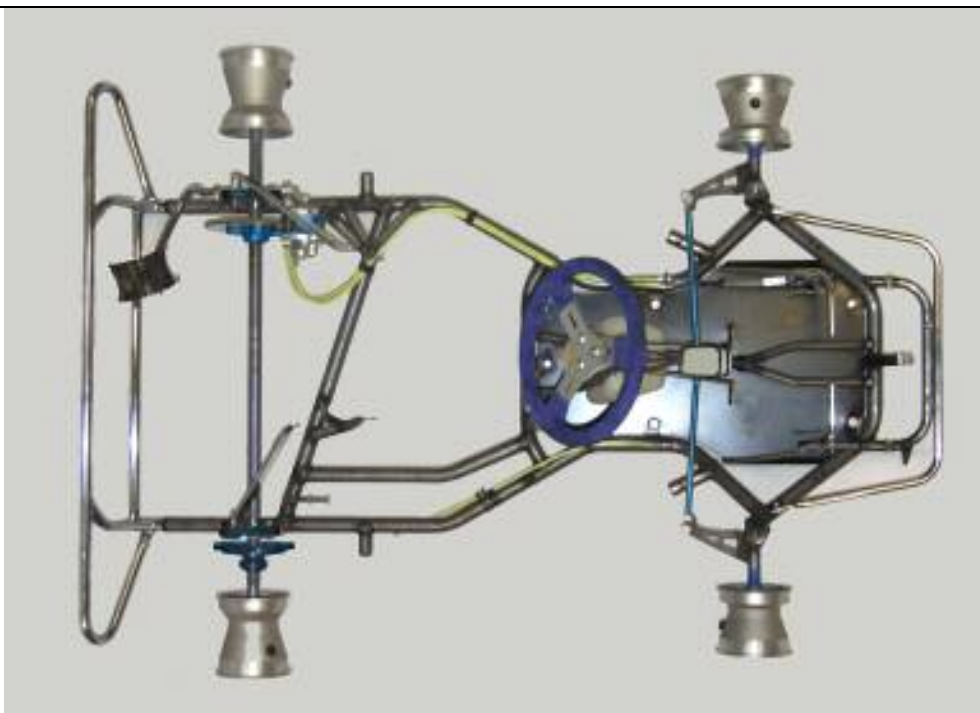
Photo of complete chassis less seat, tyres and bodywork

This Homologation Form reproduces descriptions, illustrations and dimensions of the chassis at the moment of the MSA homologation. The Manufacturer may modify them, but only within the limits set by the MSA regulations in force and with the written agreement of the MSA.